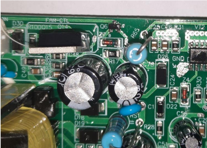
Figure 5 - Close up of R65 on PCB

R65 was replaced with a single resistor of 470Ω. This resistor should be replaced with a resistor of 390Ω, 1W rating (refer to Figure 5).