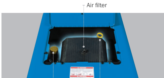
Air filter Oil fill Oil level check